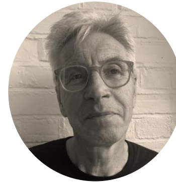
THOM Head of Neuro Intelligence